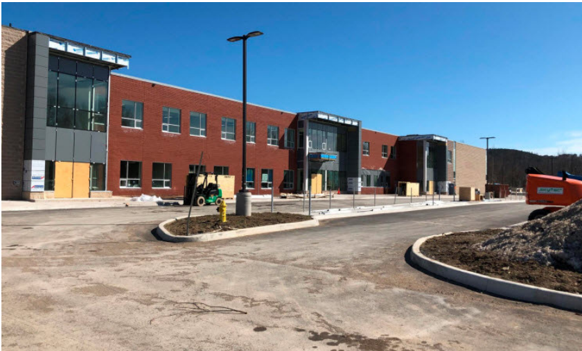
Georgian Bay Community School build project